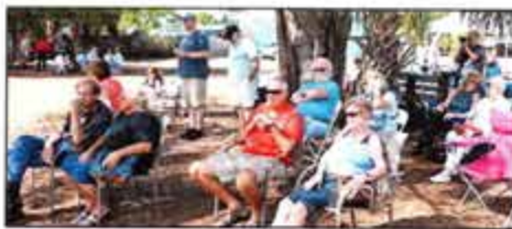
Visitors and locals enjoy the show.